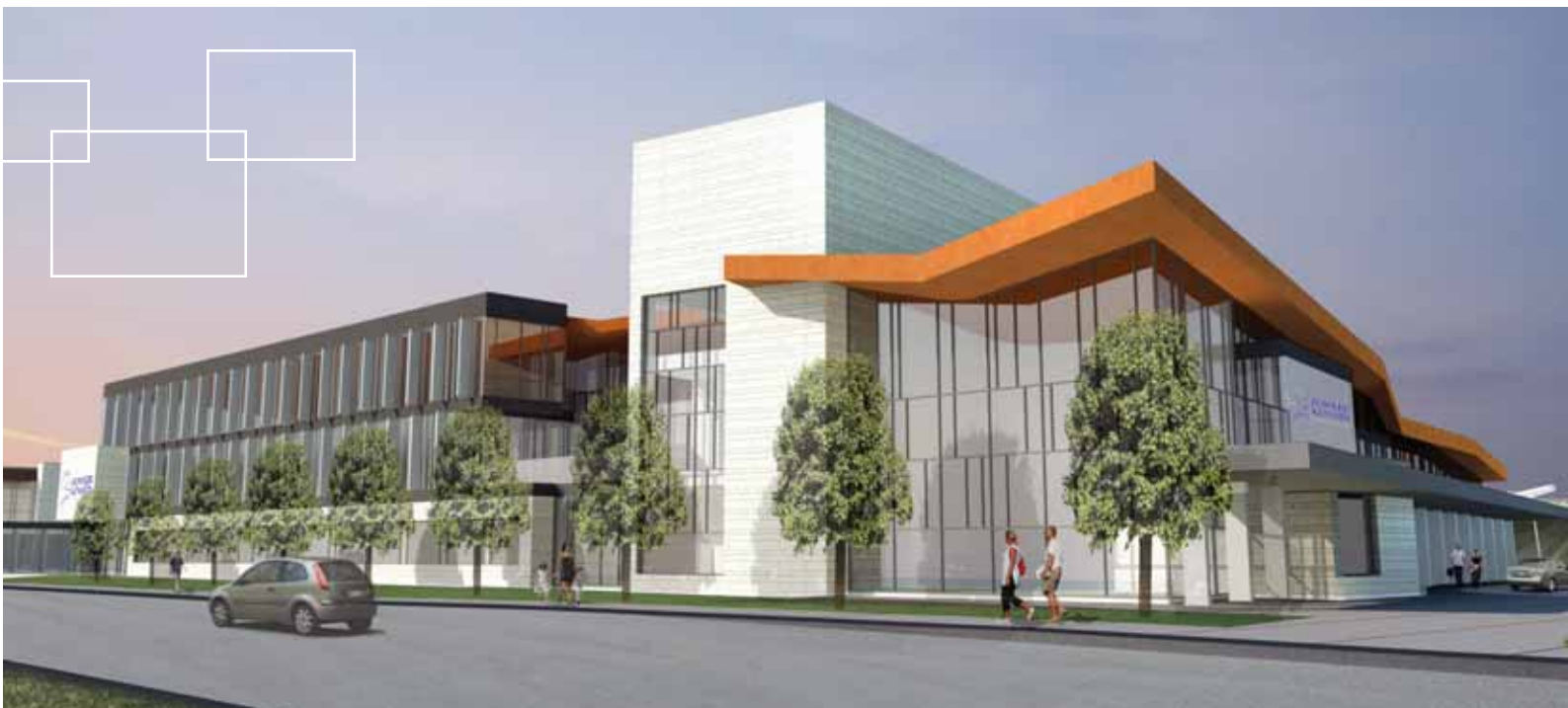
London Medical Innovation and Commercialization Network

Overall, the LMIC Network is committed to blending London's research strengths with global commercial interests and local business ingenuity to create positive economic and social outcomes. Western Discovery Park is committed to enabling this vision and to delivering on its potential.