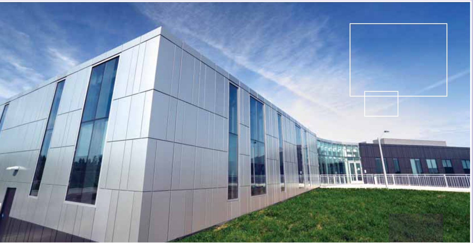
^ The Collider Centre for Technology Commercialization