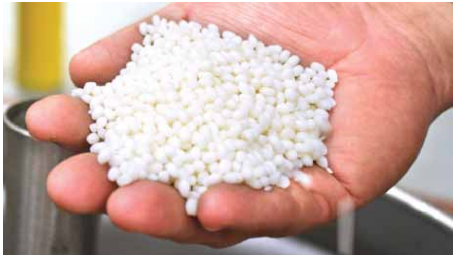
▼ GreenCore’s natural fibre composite pellet

Things continue to look good for GreenCore. Its Research Park presence includes a “mini-plant” that is producing product for at least a dozen trials for major potential customers.