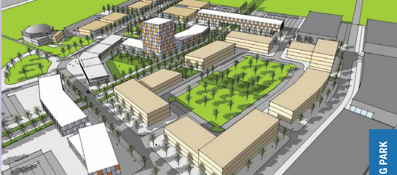
Advanced Manufacturing Park aerial looking north

Specifically, the Research Parks' team, in partnership with its counterparts at Fanshawe College and the City of London, initiated a comprehensive upgrade of the initial Park with three goals in mind: